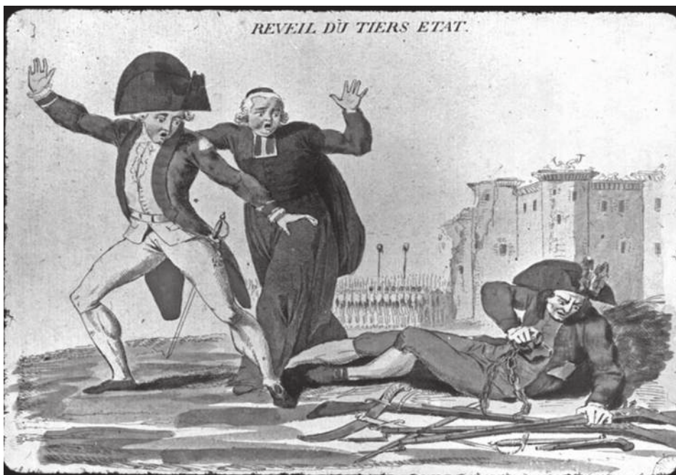
A cartoon titled 'The Awakening of the Third Estate', published in France in July 1789. The Bastille is in the background.

Answer both parts of the question with reference to the sources.